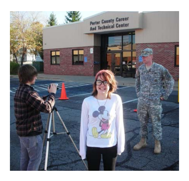
Video Productions students always have their camera ready for a story.