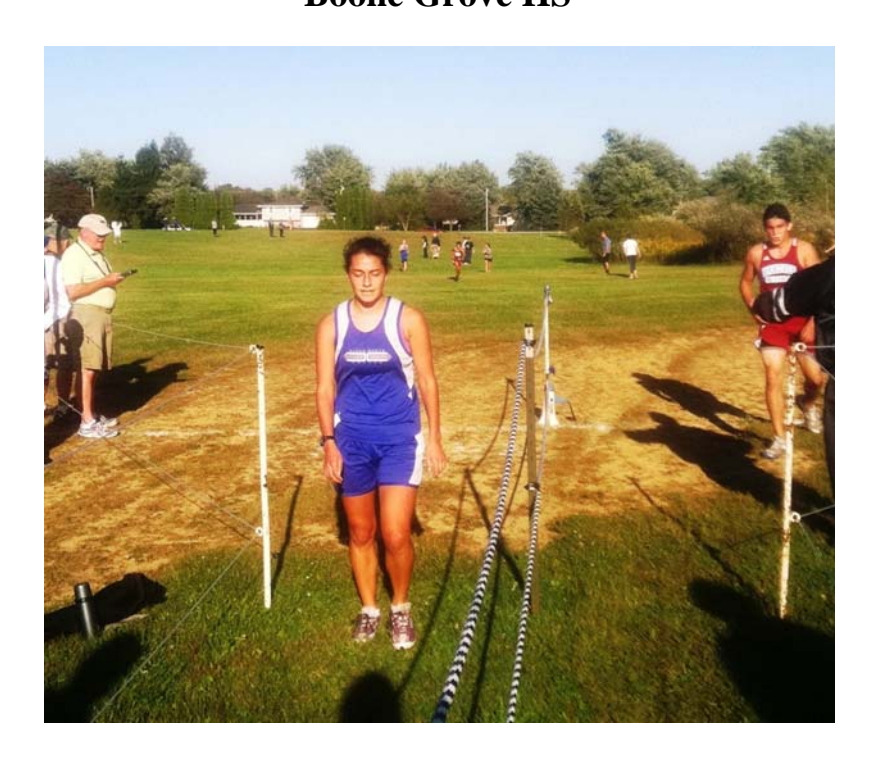
Occupations at the Career Center and is a Standout Cross Country Athlete at Boone Grove HS