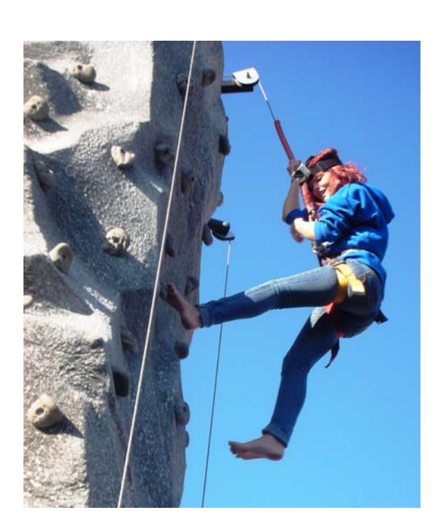
Many students scaled the wall, sometimes surprising themselves. We expect the Rock Wall to revisit in the Spring for those students who failed to bring in parent permission slips this time.